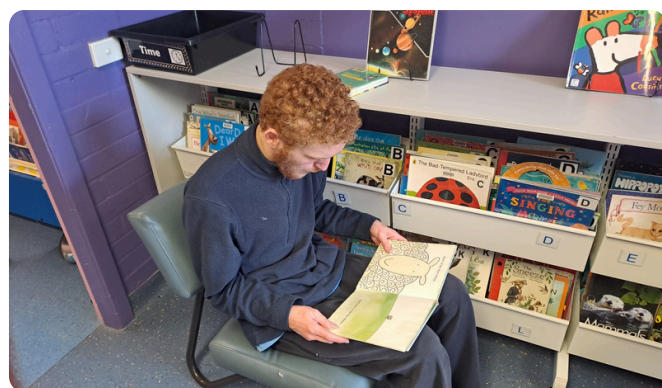
Reading in the library

In mathematics we are exploring measurement. This has included using both concrete objects and measuring devices to determine length, mass and volume. The class absolutely love the hands-on opportunities in these lessons to see and feel their learning.