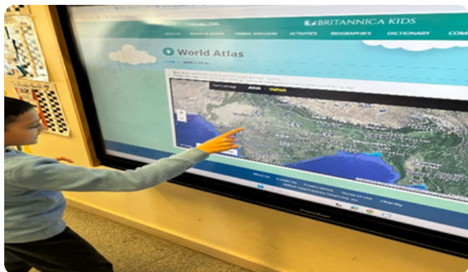
Blue Class exploring India

In Blue class, we have been learning about our heritages and cultures from around the world. We are so lucky to have history from all over the world in our class. It has been extremely interesting to learn about all our friends' ethnicities and where we come from. We used various interactive maps and websites to explore the countries unique to us, and of course the one we share; Australia! We hope to continue to keep learning about all our amazing cultures and to keep developing our inquiry skills in History this term.