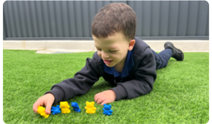
Making ABAB pattern using counting bears