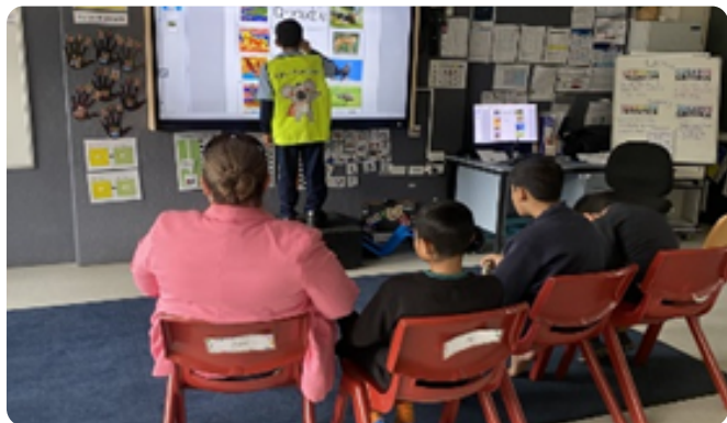
Teal Class engaged in activity on the text "Where is Galah?"

We have also been working hard in mathematics learning about multiplication and length.