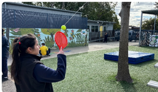
Students engaging in the Mini-Olympics