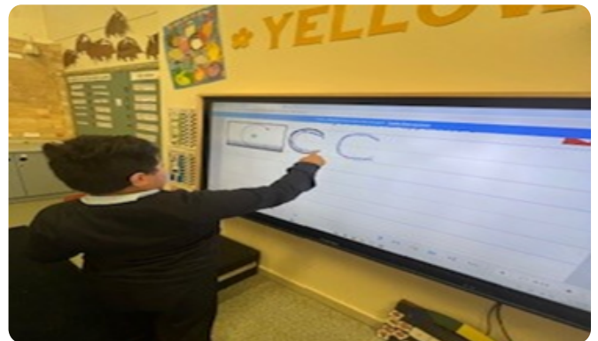
Tracing letters on the whiteboard