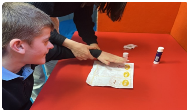
Sorting animals based on their features in Science