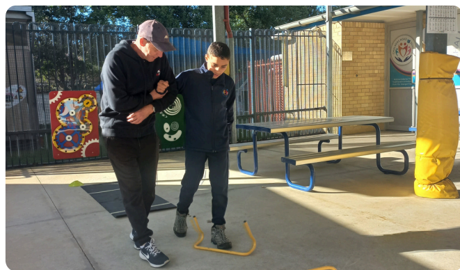
Wattle Class participating in MiniFit

In addition to their academic work, the students have continued to enjoy the Minifit program every Monday. Through this program, they have been learning new skills and staying active, making each session both fun and educational.