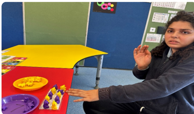
Making patterns using classroom resources