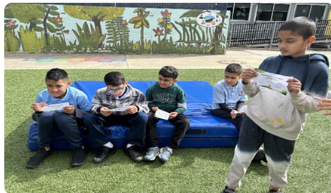
Teal class show casing their awards for participating in the Olympic Games