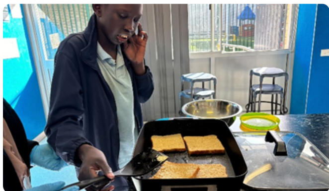
Students engaging in weekly cooking

We look forward to an exciting remainder of Term 3!