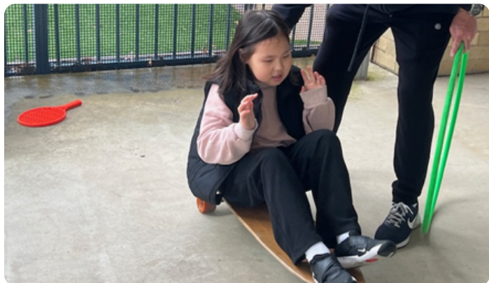
Pink Class participating in an Olympics Day activity

Pink Class have been working well since the start of Term 3. What an exciting start to our term with our Olympics Day and our open classroom and class display for Public Education Day! Our class display showed diverse ways for all our students to learn from our novel study from Term 2. This term we are using similar approaches to study narrative in English. We are so proud of our students' efforts!