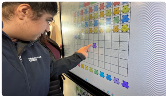
Making patterns using the Interactive Whiteboard

Banksia has had a great start to Term 3. We began our math lessons developing our knowledge and skills about patterns. We used the interactive whiteboard to make patterns using coloured icons and then followed on from this lesson to use the objects we have in class to make our own patterns. We made different patterns by using two and three different colours.