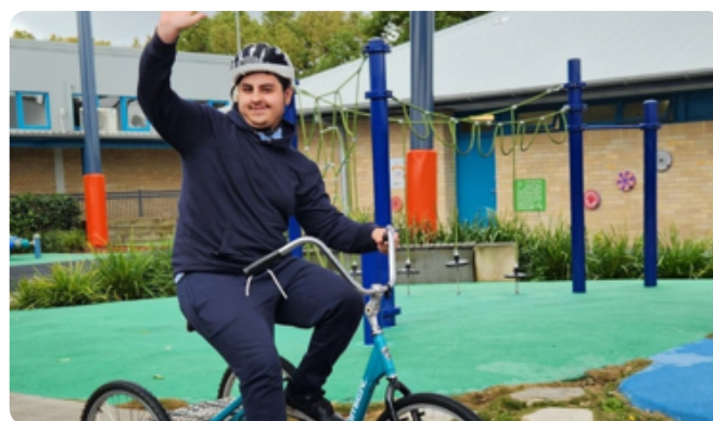
Bike riding in the playground