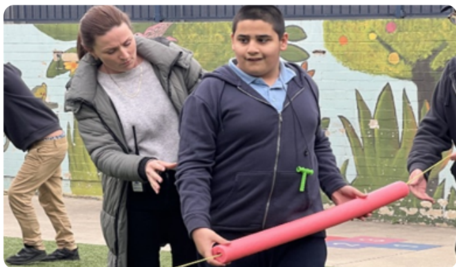
Waratah Class taking part in MiniFit