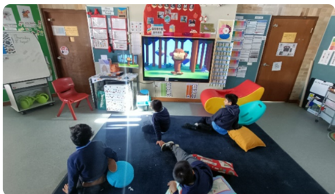
Meditation Time in PDHPE

A big G'day from Red Class! This winter, Red Class has been full of activity and learning. Our students have enjoyed the book "Where is Galah?" and have been exploring concepts of length, from short to long. In science class, we're learning about the Sun and the Earth. Meditation has been a calming addition to our routine, and the School Olympics provided lots of fun and excitement. Students have also enjoyed their weekly MiniFit program, practicing their gross motor skills. Our SATPIN word awareness activities have been engaging and enjoyable for everyone. We've been focusing on our Positive Behaviour for Learning (PBL) goals, particularly 'staying together' during visits to the high school playground. Despite the chilly weather, Red Class is brimming with enthusiasm and progress! A big thank you to all the parents who joined us on open day—we're excited to see you again soon!