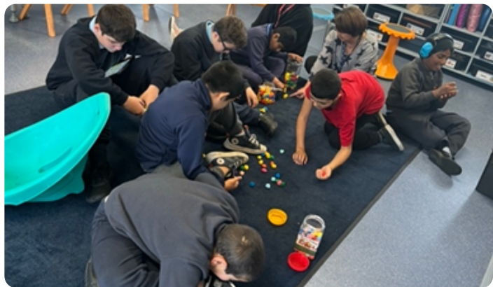
Magenta Class engaged in making equal groups during Math

In our Key Learning Areas, we are exploring Australia's settlement history, how we can live healthy lives, the Earth and our solar system, multiplicative relations and length, the composition of fairytale dramas (characters, setting, props), and different types of narratives.