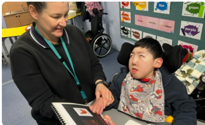
Pink Class engaging in Fantastic Mr Fox