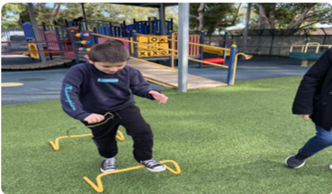
Jumping over hurdles

To celebrate the Olympics, we participated in our mini Olympics in Chalmers Road School with the team from MiniFit. We all worked hard and supported each other in all our activities such as jumping over hurdles. We have been learning a new letter each week in Yellow class and have been practicing our tracing with online activities and worksheets. Everyone has been doing a great job, and it has been pleasing to see the whole class engaging actively.