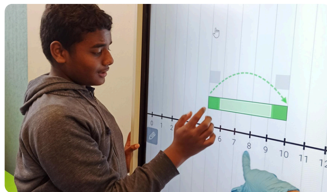
Students tracking their achievement for the year