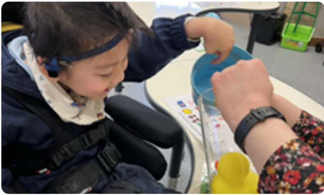
Pouring water to help Alexander to float

In Green class, the students are studying the book Alexander's Outing. As they follow the adventures of Alexander, the wayward duckling, they've been using problem-solving skills to figure out how to save him. Through this engaging story, the students developed critical thinking skills as they worked together to find creative solutions, just like the characters in the book. They have also been actively learning about patterns in mathematics by using colourful blocks to represent and create their sequences. Through hands-on activities, they've been exploring how patterns are formed and identifying repeating elements. This interactive approach not only makes learning about patterns fun, but it also enhances their ability to recognise and predict sequences in various contexts.